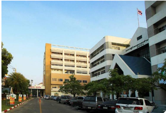
Nakhorn Pathom Hospital