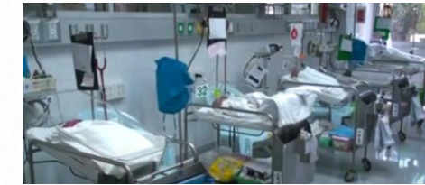
Sick Newborn/ NICU ward