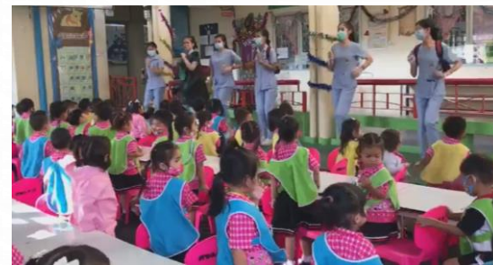
Nakhon Pathom Municipal & NPRU Children Development Center